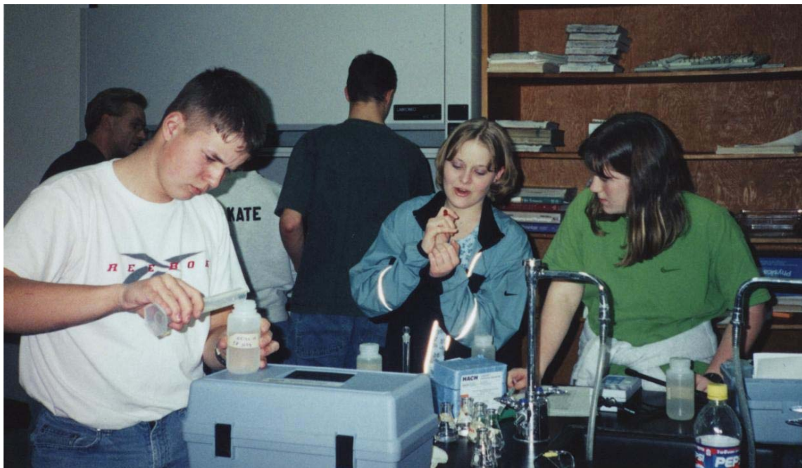
Area River Watch students perform analysis of water quality samples in school laboratory.

The RLWD plans to extend funding for the program in eight area schools for a period of ten years. The goal of this funding is to provide a stable River Watch Program in each school. Personnel from the RLWD and local Soil and Water Conservation Districts will interact with teachers and students providing a framework for the program.