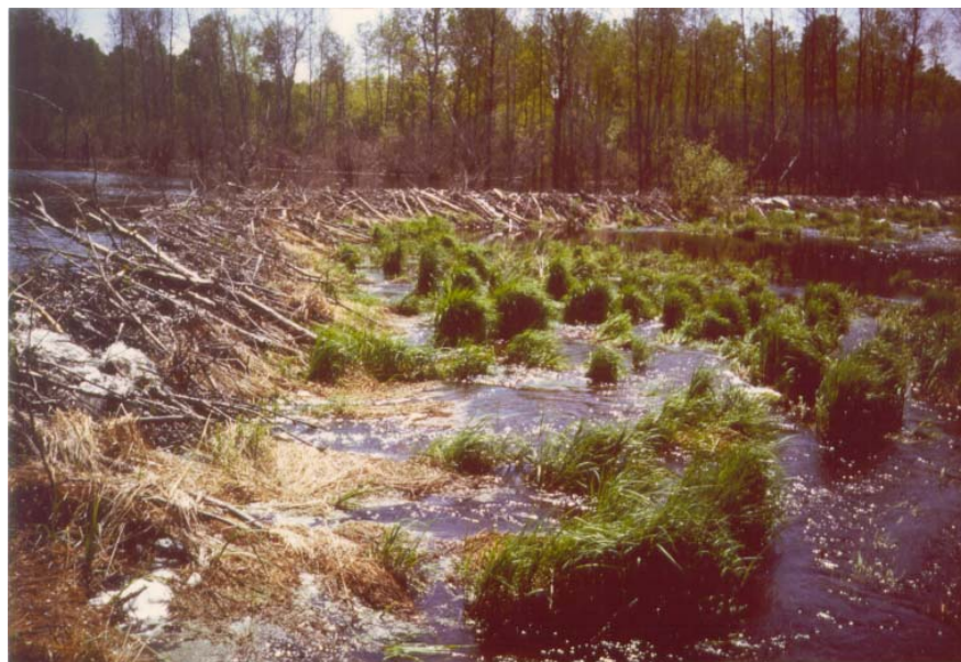
Picture of the Moose River Beaver Dam, Section 7 and 8, T157N R57W, Beltrami County

The study was sponsored jointly by the Red Lake Watershed District and the Red River Watershed Management Board.