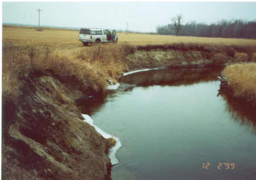
Stream bank erosion site on the Clearwater River, Section 27, Greenwood Township, Clearwater County.

The Section 319 grant project will also involve stabilization of two other sites: one in Section 6, Gully Township, Polk County on the Lost River and the other in Section 31, North Equality Township, Red Lake County on the Clearwater River. Design and construction work on these projects will be performed in 2001 and 2002.