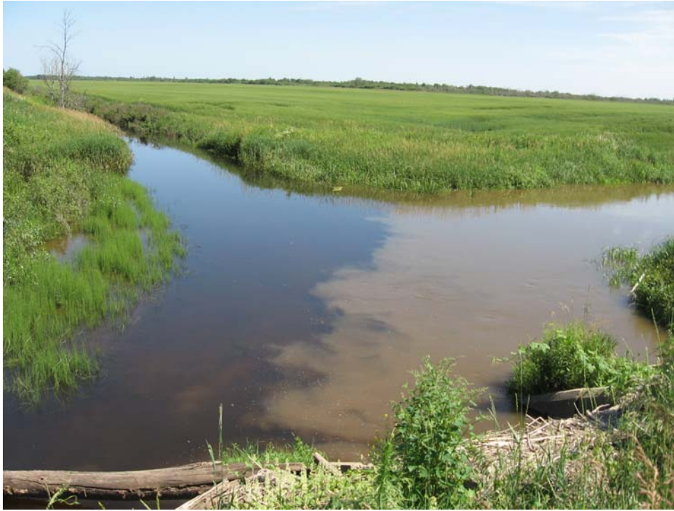
Figure 1. Plume of sediment-laden water entering the Moose River from the Hwy 54 ditch (Branch 41 of JD21).